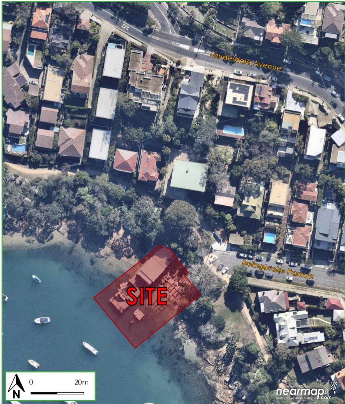
Figure 2 – Site Plan